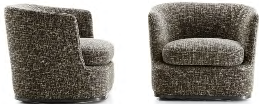
Armchair Saffira 153