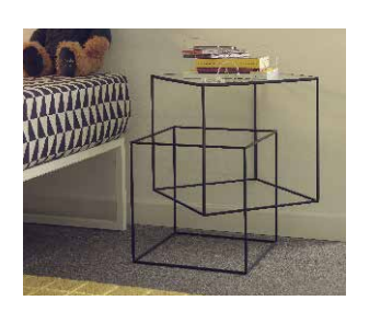
THIN BLACK TABLE

Lucky | Peg Bed | Peg Chair | Koeda | Tuta | Waku