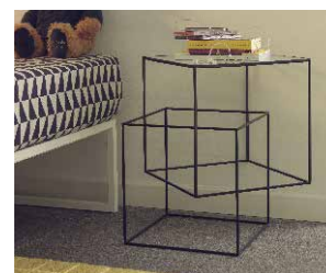
THIN BLACK TABLE

Lucky | Peg Bed | Peg Chair | Koeda | Tuta | Waku