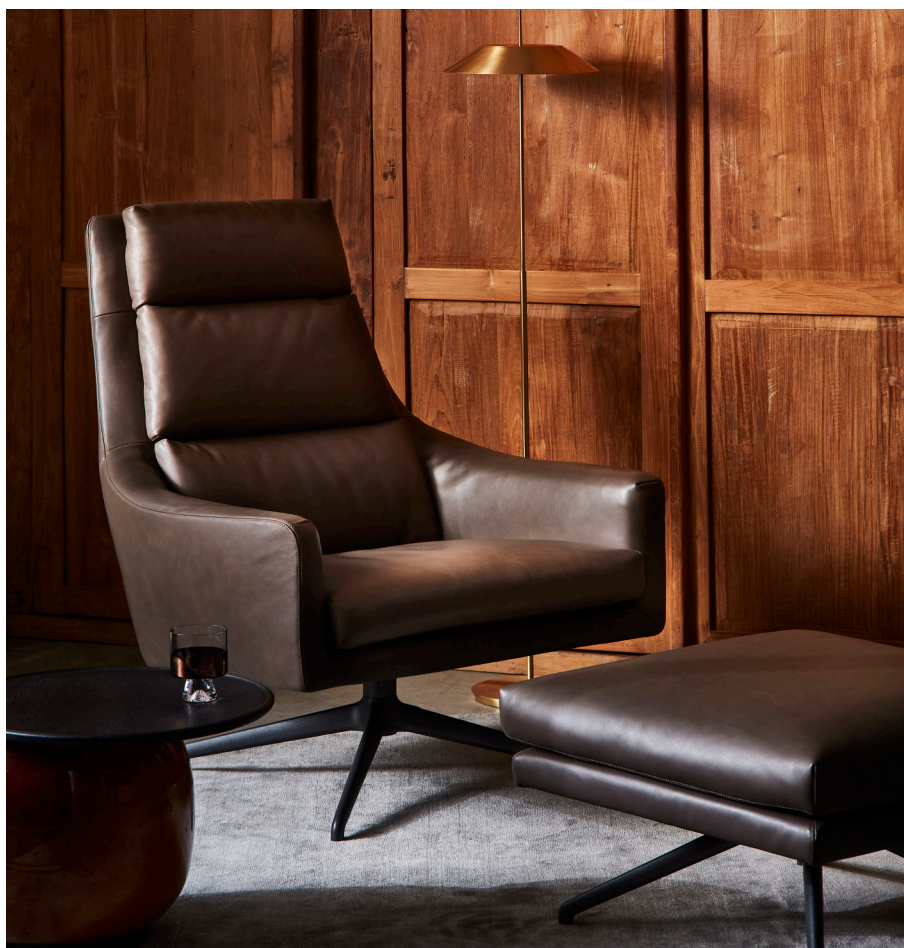
SHOWN MODEL IS EXECUTED IN LEATHER - LUXURY 11