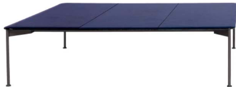
Coffee table (waterproof cover included)