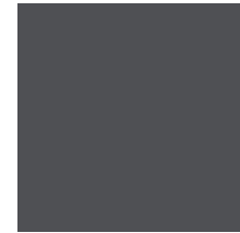
Frame: 0236B Anthracite painted