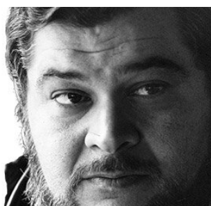
Joe Colombo 1970