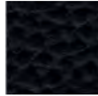
Seat: Black embossed thick leather

Charlotte by Antonio Citterio is a tribute to lightness. The shell is completely covered, but the frame profile is visible on the chair side, thus highlighting the line of the seat. The cover is in raw cut full grain leather.