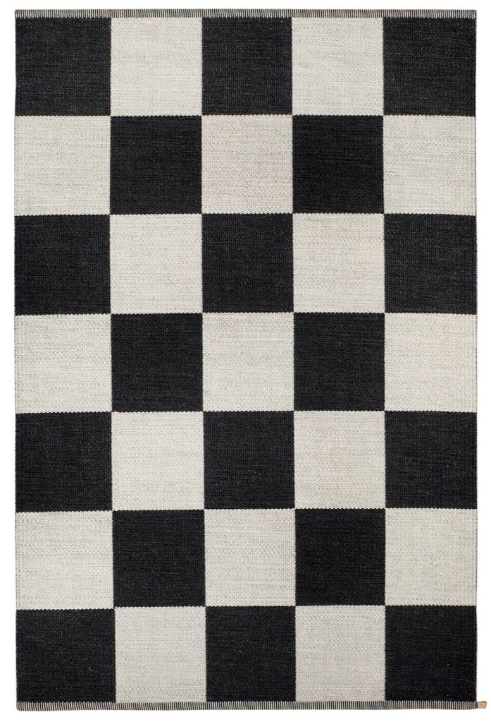
Rug 200x300 cm, Sunny Day 450