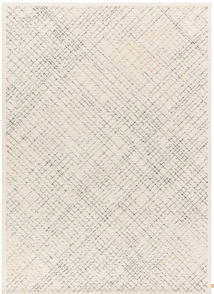
Rug 200x300 cm, White Diamond 500