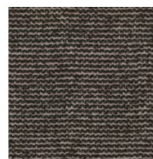
48x48cm Optional cushions: Leon 215