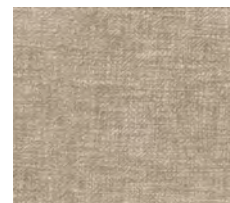
Sofa & Back Cushions: Solaris 280

Dives Soft is a family of linear and modular sofas available in various sizes and in two seat depths. The version with a narrower seat depth is distinguished by its armrests and backrest, which feature two different upholstery styles: smooth on the exterior and quilted in classic Chesterfield style on the interior. A sophisticated and refined detail to be enjoyed. In the version with a wider seat, the upholstery is entirely smooth, with soft down feather cushions making for an even more welcoming and relaxed looking sofa. Both versions share the same, soft and generous padding, for optimal comfort. The upholstery comes in a wide range of fabrics and leathers with special couture details: decorative, matching or contrasting blanket stitching for the fabric versions, and elegant “envelope stitching” for the leather ones. The feet are either covered in fabric or leather or available in a shellac finish.