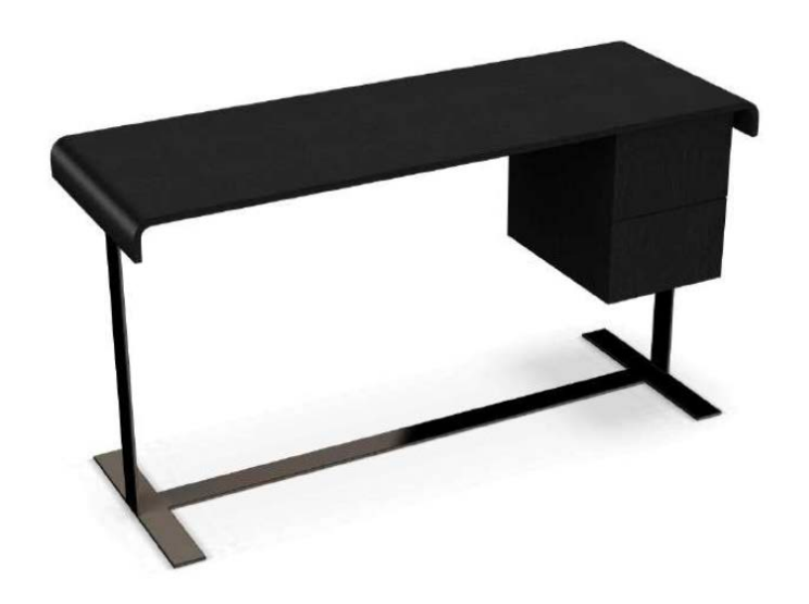
Writing Desk Brushed black oak, Black chrome frame