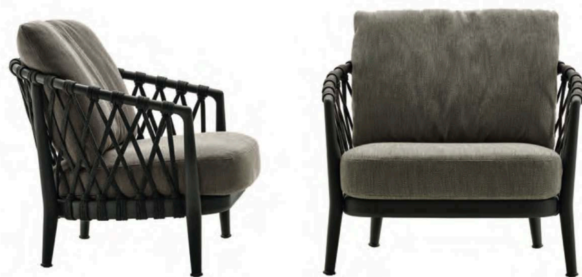
Armchair - Cover Not Included