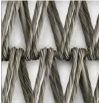
Frame: 0612T Dove Grey Polyethylene Interlacing