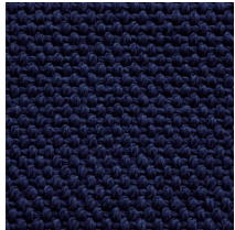
Back & seat cushions: Lesia 800

Fat Sofa sectional, comes with: x2 optional cushions (pillow style) OGW48_48 as shown below