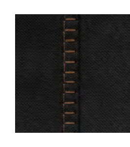
Stitching: Sella 1060