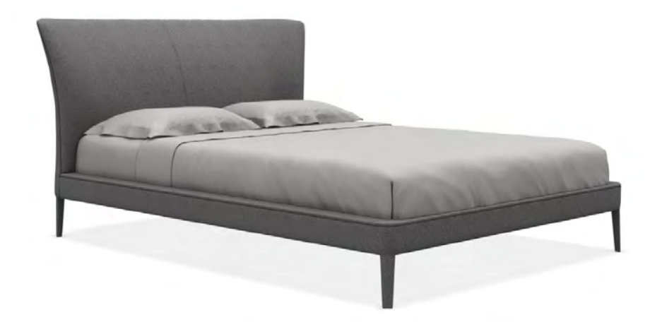
Febo bed - Lodi 251 Queen size King size