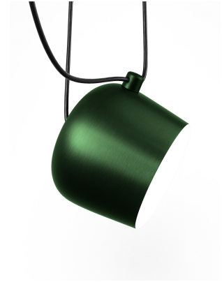
FU009039 Anodized Green