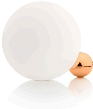
Table lighting fixture comprising an aluminium sphere machined from solid and then gold-coated with 24 K gold. Blown glass opal diffuser. LED light source with dimmer switch on the power cable.