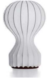
○ FU270109 White