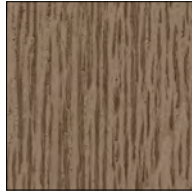
Teak antique grey

Gio, designed by Antonio Citterio, is the new series with a contemporary classic accent dedicated to living in the open air. A complete range of sofas, end units, chaise longue, sunbeds, armchairs, chairs, tables and complements which have been developed from solid teak structures with a special antique grey finish, which gives the wood a particular lived-in aspect and silver-grey reflective quality. Through the quick ship program the linear sofa 238 cm and the rectangular small table 120 cm are available.