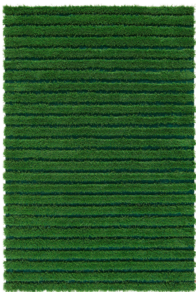
Rug 170 x 240 cm, Jungle 330