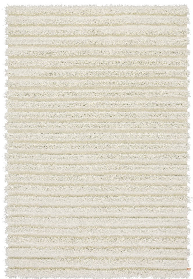
Rug 170 x 240 cm, Ghost 880