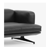
Noble Black Leather