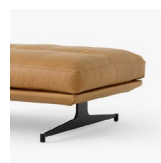
Noble Cognac leather