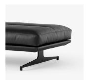
Noble Black Leather