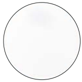
T02 RAL 9016 White