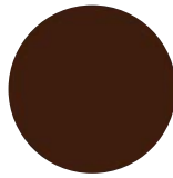
T08 RAL 8019 Brown