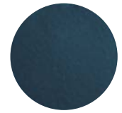
T16 RAL 5003 Blue