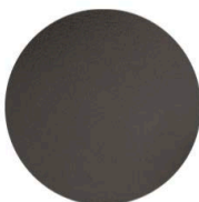
T148 Matt Black Nickel