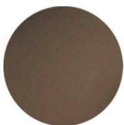
T147 Ancient Copper