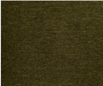
Byram 981 Green Mohair