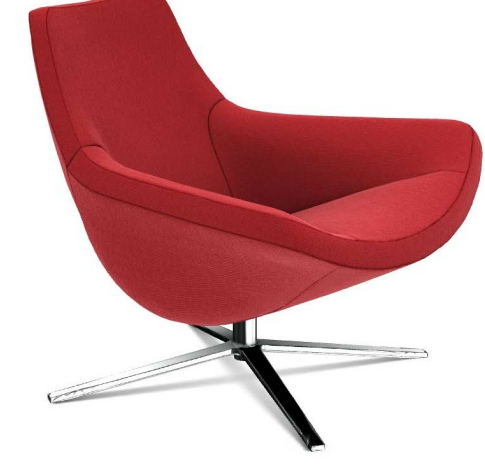
Metropolitan 14' Armchair Este 700, Bright Brushed Aluminum Frame