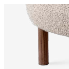
Karakorum 003 & Walnut