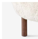
Moonlight & Walnut