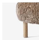
Honey 50mm & Oak