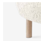
Moonlight & Oak