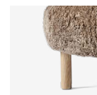
Sahara & Oak