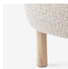
Karakorum 003 & Oak