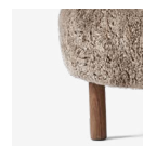
Sahara & Walnut