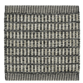
Grey Stone 589