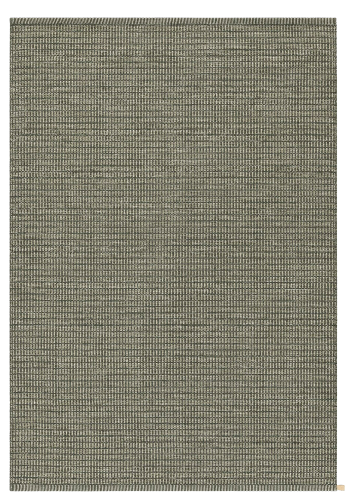
Rug 170x240 cm, Willow Green 585