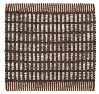
Redwood Haze 721