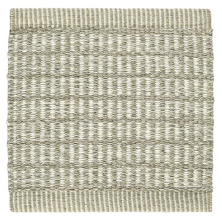
Linen Beige 882