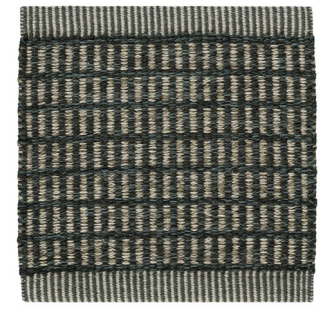
Evening Blue 586