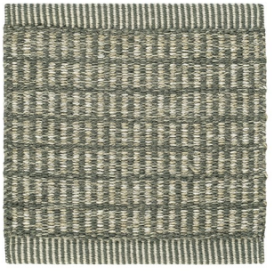
Willow Green 585