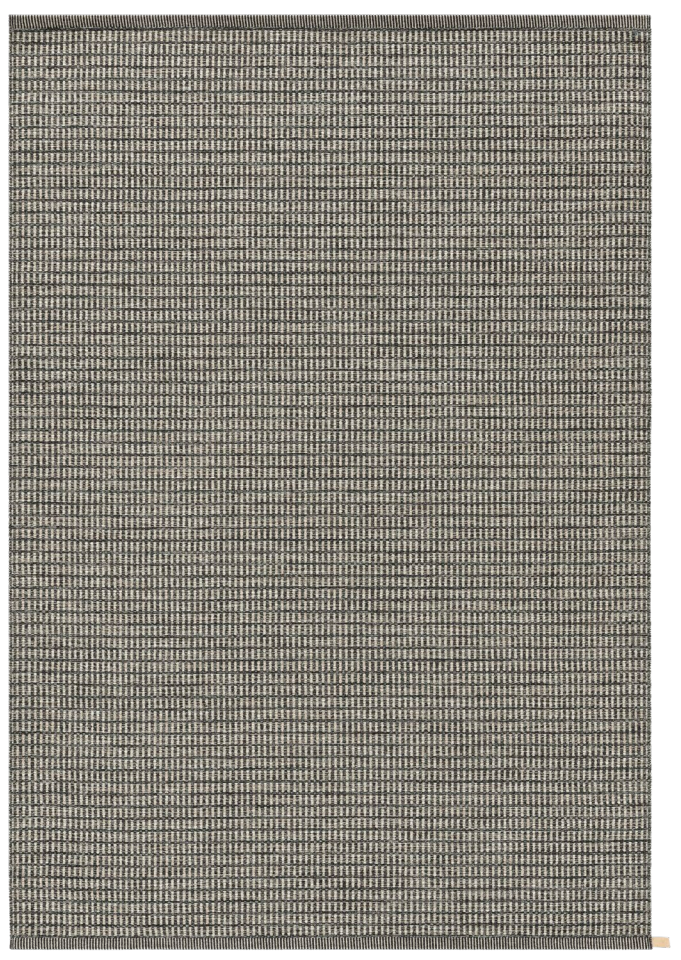
Rug 170x240 cm, Grey Stone 589