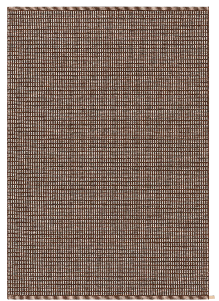
Rug 170x240 cm, Evening Blue 586