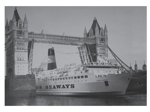
Dana Anglia - 1978

More than 30 years after the ferry's maiden voyage it has been renamed and upgraded several times and has sailed on a number of different routes between Denmark, the UK, France, the Netherlands, Poland, Norway and Sweden. Through all the years, the chairs have remained on board!