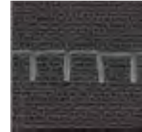
Stitching: Pearl grey 1011