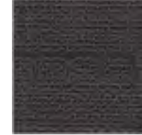
Stitching: Smoke grey