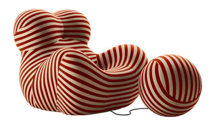
UP5_6 "Limited quantities" Soara 170