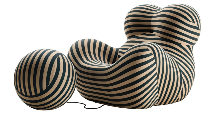
UP5_6 Soara 140