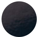
T20 RAL 9005 Gloss Black