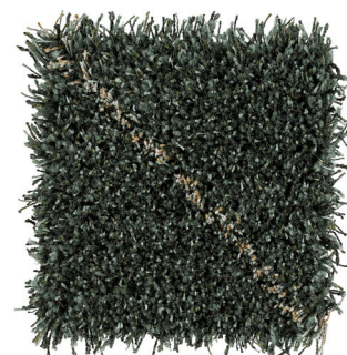
Green Shadow 305