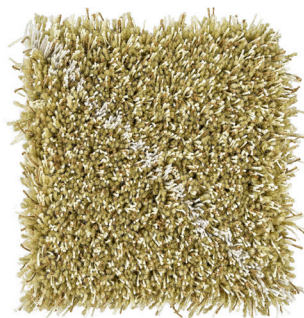
Lemon & Lime 306