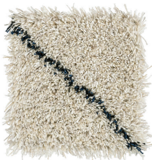
White Tea 120