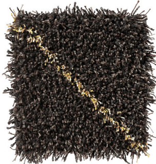
Black Bean 504