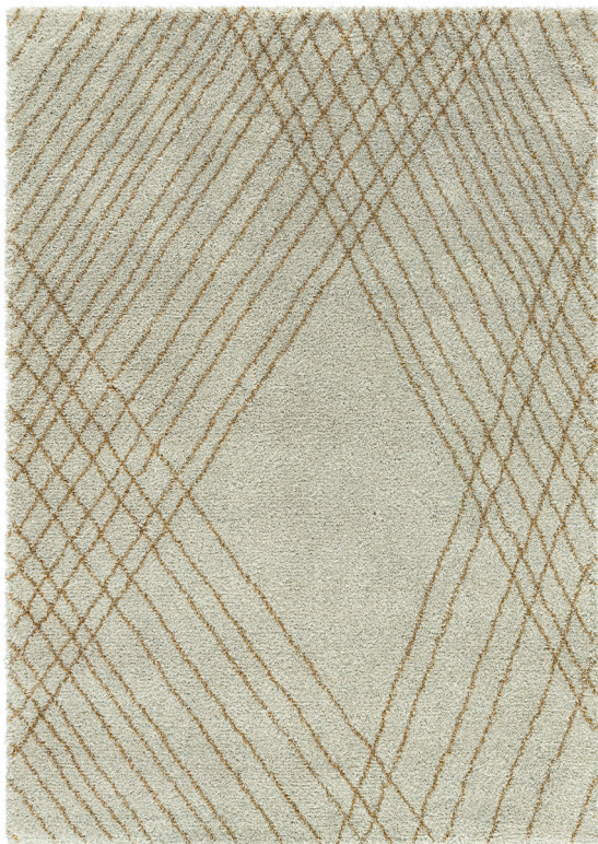
Rug 170x240 cm, Silver Fern 505