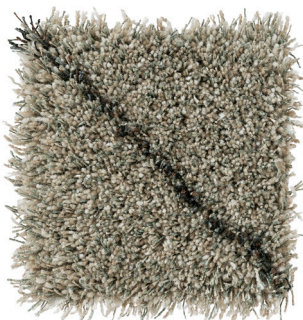
Silent Grey 803