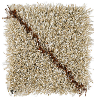
Oat Shine 802