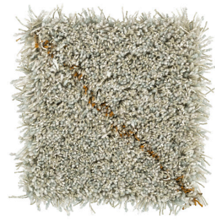
Silver Fern 505