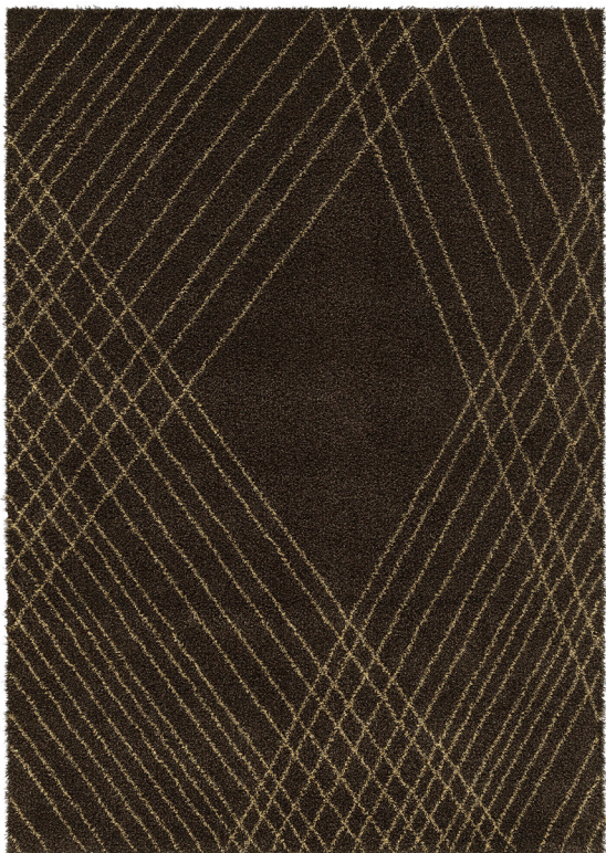
Rug 170x240 cm, Black Bean 504