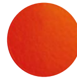
T10 RAL 2004 Orange