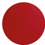
T12 RAL 3000 Red