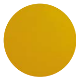
T09 RAL 1003 Yellow