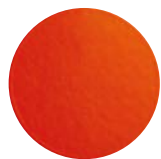
T10 RAL 2004 Orange