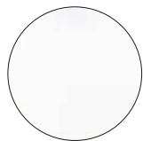
T02 RAL 9016 White