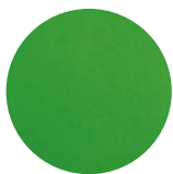
T14 RAL 6018 Green