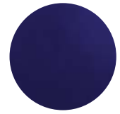
T63 RAL 5002 Blue