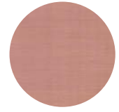
T64 Brush Matt Copper