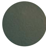
T61 RAL 6014 Green