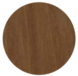
T43 Dark Walnut