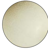
T25 Matt Champagne Gold