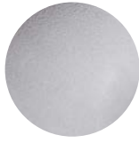
T24 Satin Chrome