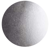
T23 Polished Chromed