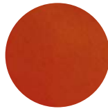
T11 RAL 2011 Orange