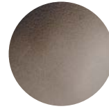
T28 Polished Black Chromed