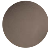
T27 Matt Black Chromed