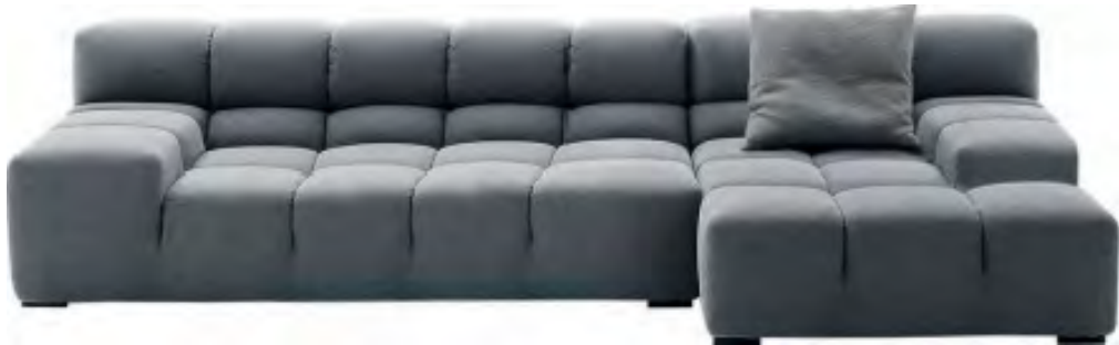
Sectional sofa Edit 251

*Comes with 1 extra throw cushion: Edit 251