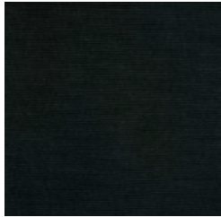
Feet: Black color