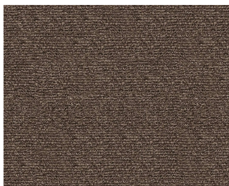
13O045 Osaka Anthracite