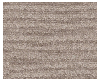
13O044 Osaka Argento