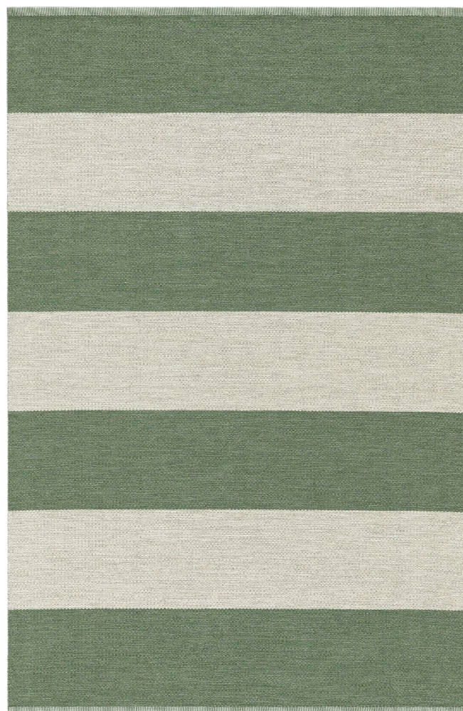
Rug 195x300 cm, Grey Pear 350