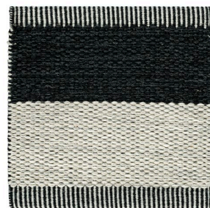
Midnight Black 554