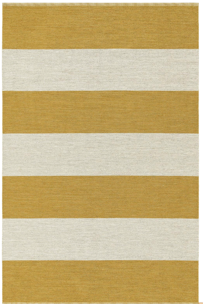
Rug 195x300 cm, Sunny Day 450

Design GUNILLA LAGERHEM ULLBERG/KASTHALL DESIGN STUDIO Woven rug in pure wool