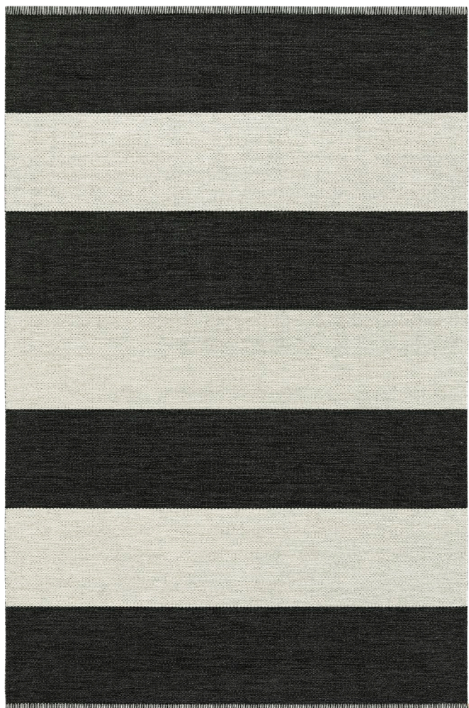
Rug 195x300 cm, Midnight Black 554