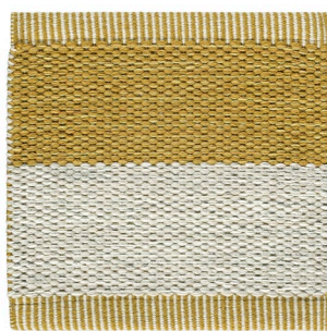
Sunny Day 450