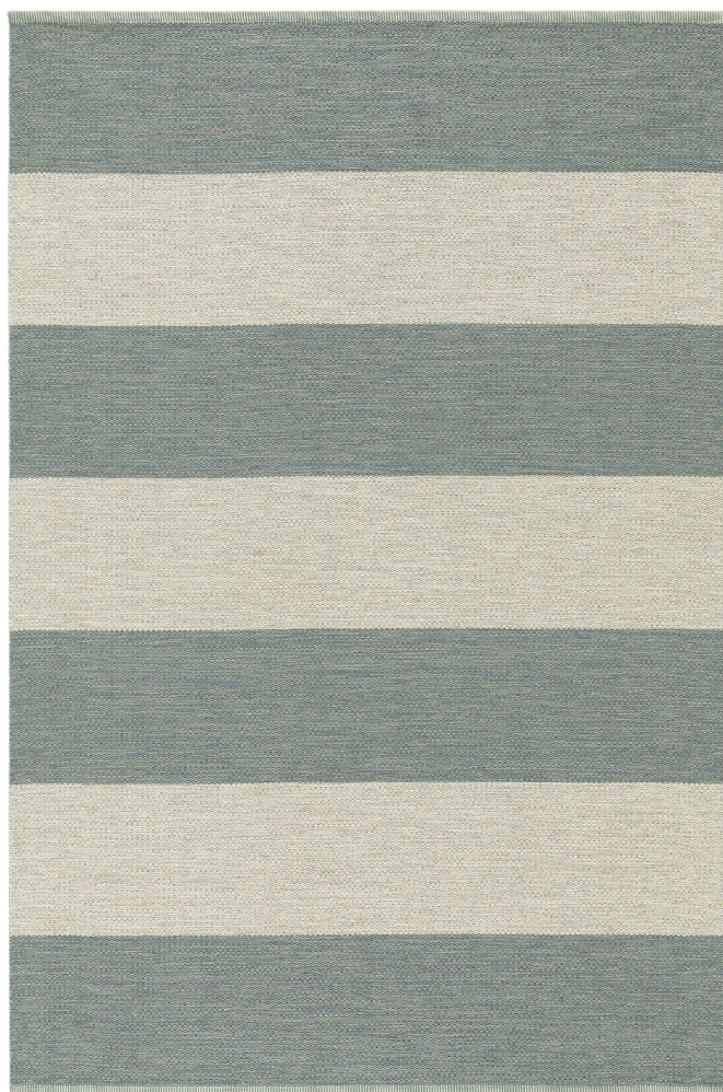
Rug 195x300 cm, Polarized Blue 251