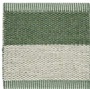
Grey Pear 350