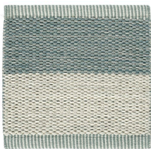
Polarized Blue 251

Design GUNILLA LAGERHEM ULLBERG/KASTHALL DESIGN STUDIO Woven rug in pure wool